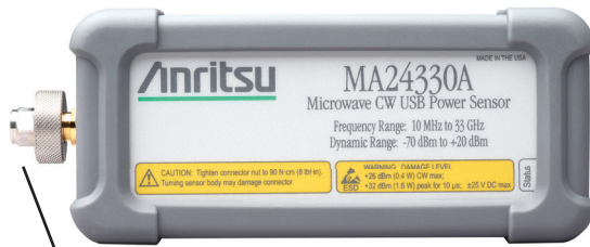
K and V Type connectors designed for use with a torque wrench ensuring repeatable connections